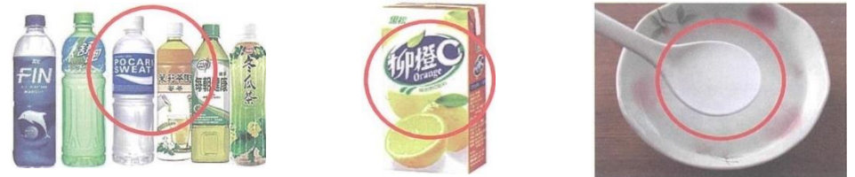
drink without residue