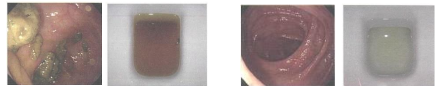
Not sufficiently clean